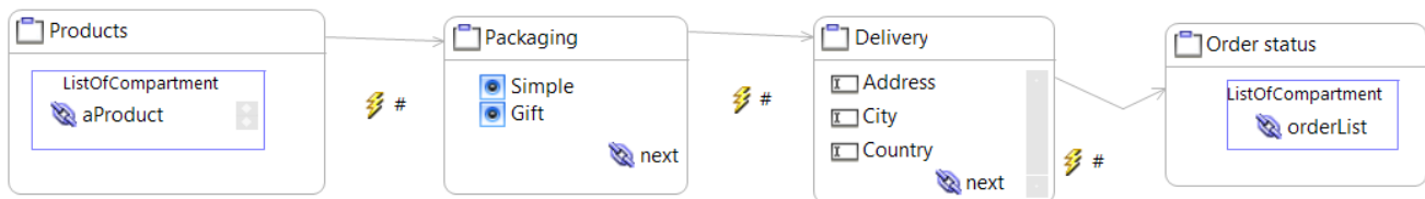
Fig. 1 Simple checkout process modeled using WebSpec

In most mature Web design approaches, such as UWE, WebML, Hera, OOWS or OOHDM (see [7] for description and examples of each approach), a Web application is designed with an iterative process comprising at least conceptual and navigational modeling. According to the state-of-the-art of model-driven Web engineering techniques, most of these design methods produce an implementation-independent model that can be later mapped to different run time platforms. For the sake of clarity we will concentrate on the conceptual,